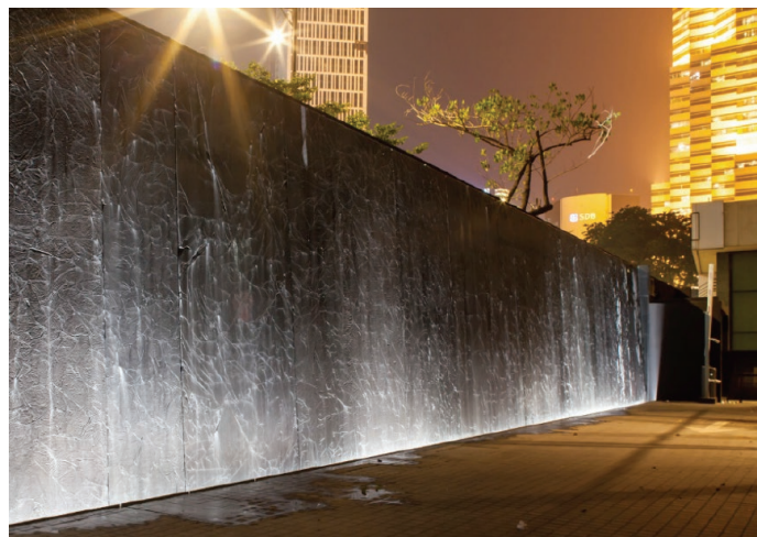
[Full view of the Water Feature Wall-5 meters (height) by 47 meters (length)]