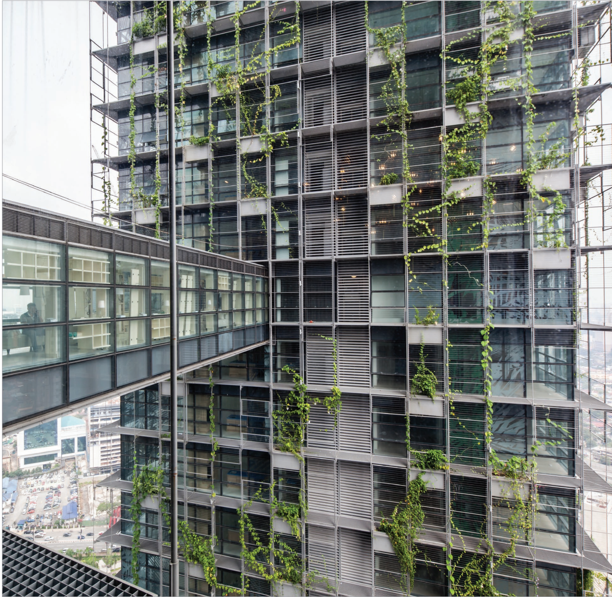
[Full view of the 34 floor Sky Bridge]